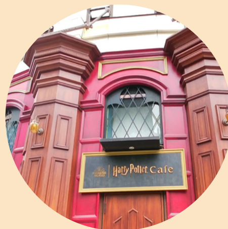
Harry potter Cafe