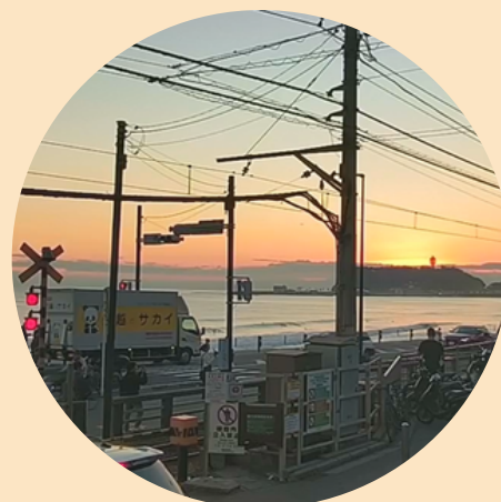
Kamakura Kokomae Stn