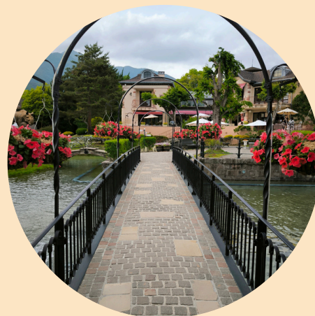
Music Forest Museum