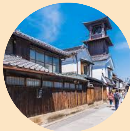
Toki no Kane Bell