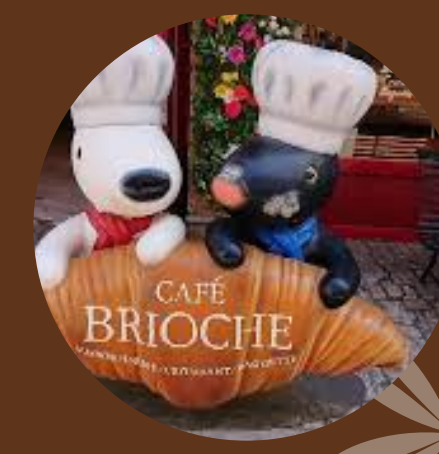
La Ville de Gaspard et Lisa Café