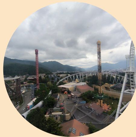
Shining Flower Ferris Wheel