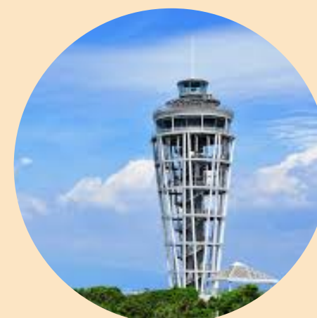
Enoshima Sea Candle