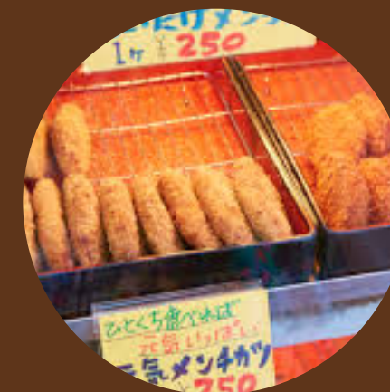
Niku no Suzuki