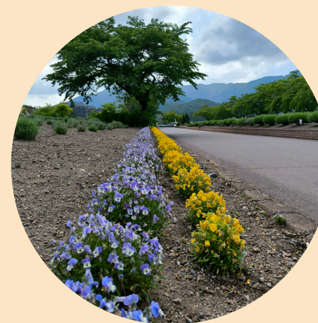
Shinobi No Sato