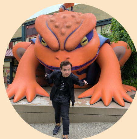
Ninja Way Museum