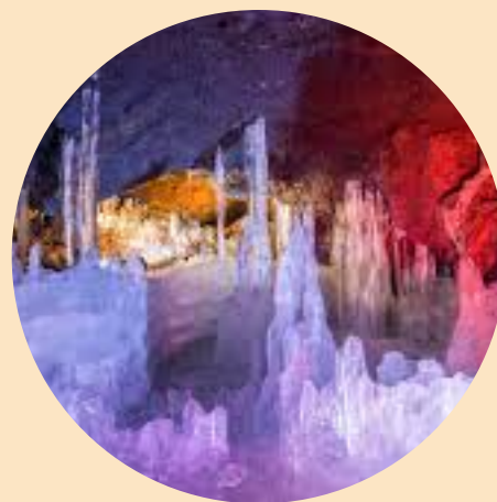
Fugaku Wind Cave