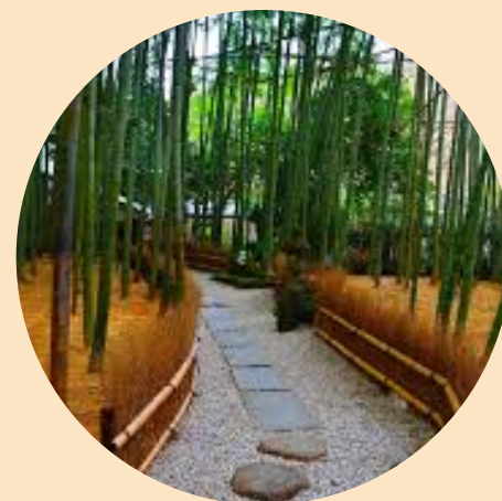
Kamonka Bamboo Garden