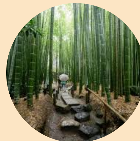
Hokuji Bamboo Forest