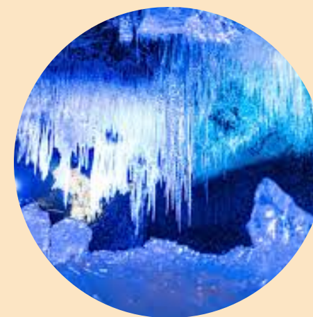
Narusawa Wind Cave