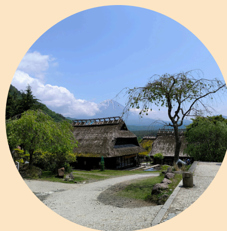
Iyashi No Sato